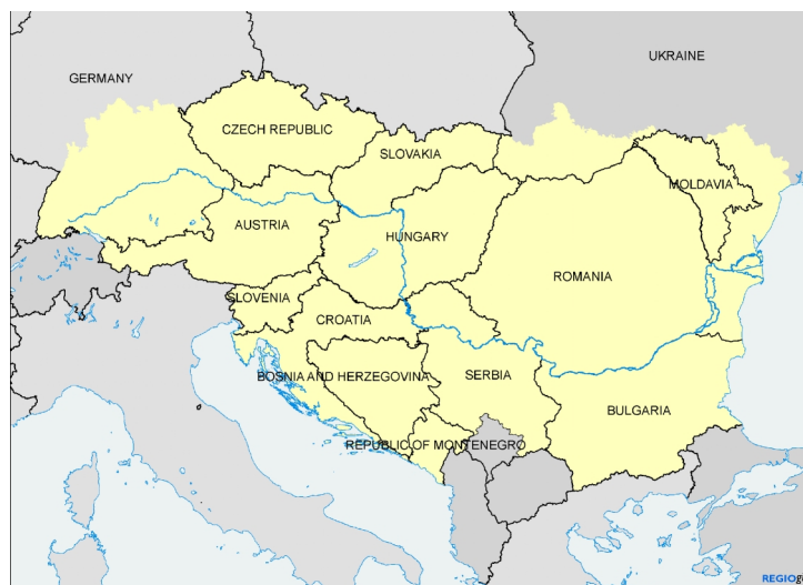
Figure 1 – Territorial coverage of the Danube region strategy